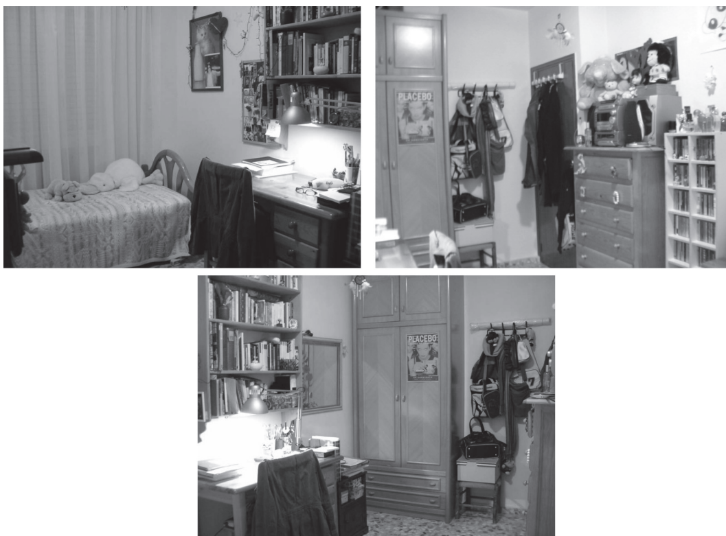
Figure 1. Joint presentation of the first female bedroom shown to participants

In order to choose the adjectives that best defined each resident, the frequency with which adjectives were selected for each room was calculated. The mean and the standard deviation of this percentage were calculated (see Table 1), and a criterion