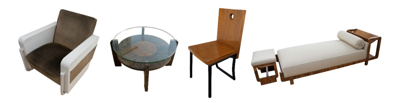
Fig. 4. Modern furniture preserved, frozen in time, Florya Atatürk Marine Mansion (DATUMM Archive, 2023).

and Fazil Aysu in 1935, forming a close connection between the building and its fixed and mobile elements. 48. This mansion was made as a resting location for Atatürk to support his health, and thus contains remnants of the day, such as Atatürk's sitting scale to measure his weight. In 1988, the building was turned into a museum, and several changes can be observed with regards to the location of especially the mobile features. Even in a museum that aims to preserve an initial state, interiors cannot always be maintained as true to the original. 49