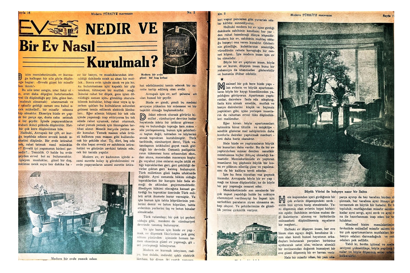
Fig. 3. "What is a Home and How Should it be Established?", Modern Turkey Journal, March 8, 1938, 16–17. (DATUMM Archive, 2023).

Moreover, publications also felt responsible for educating the modern individual with didactic pieces on the interior; on what a home is and how it should be established (fig. 3). These pieces included detailed explanations of behaviour, intertwined with spatial characteristics and direction in terms of interior layout, furniture, and fittings.