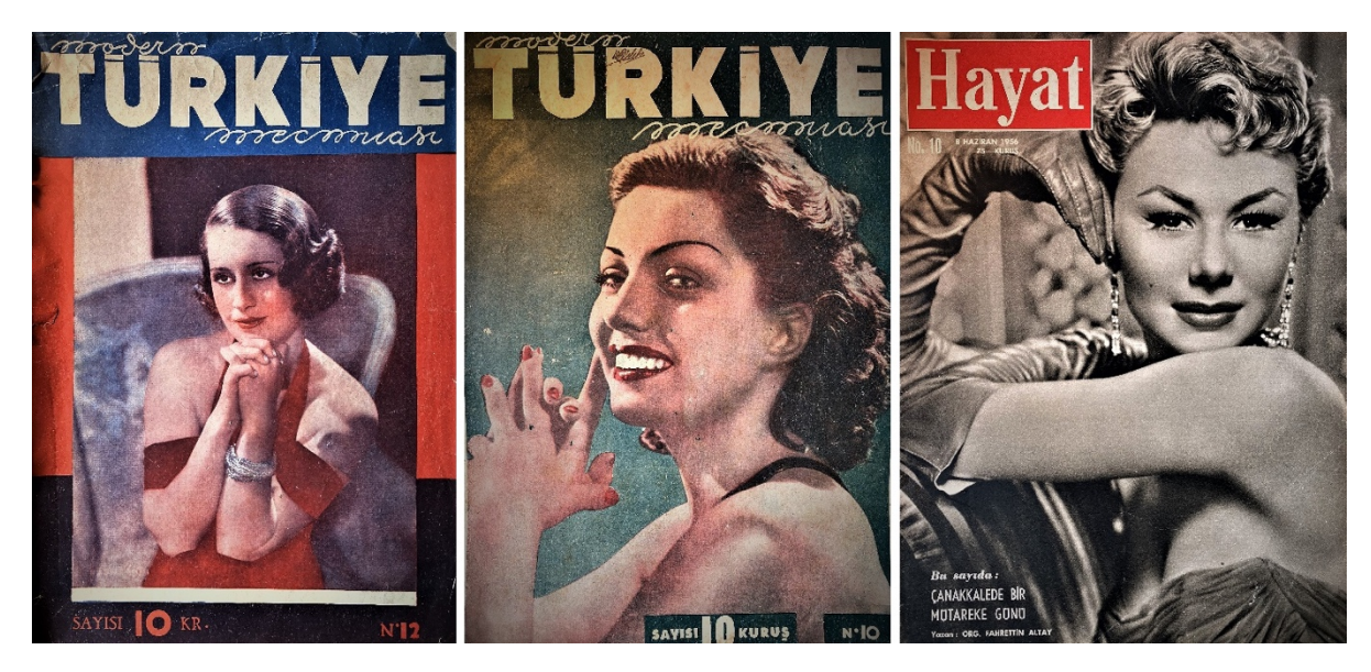
Fig. 1. Modern Turkey and Life Journal Covers (1930s-1970s).

The existing lack of documentation and preservation of modern interiors that comes from the constantly evolving nature of the interior is strengthened by the fact that Turkish folk literature is rooted in Central Asian nomadic traditions. Past wisdom is passed onto generations through folklore, followed by poetry and prose in the Ottoman era. Although modernization in Turkey started during the Ottoman Empire, the paper focuses on the period that corresponds with the foundation of the republic.