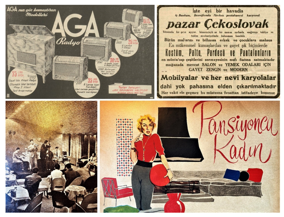
Fig. 2. Photographs, Illustrations and Advertisements of Modern Devices and Furniture that Define Interiors Could be Found in the Modern Journals ( Modern Turkey and Life Journals, 1930s-1970s) (DATUMM Archive, 2023).

Turkish Republic in 1923, modernization required questioning tradition which led to a steering away from the past. The Bauhaus approach which cut ties with the past, understood and valued tradition as the artisans' labor, however accepted art that was part of the present. Thus, the spirit of the age or 'Zeitgeist', aligned with the cultural politics of the Turkish Republic.<sup>39</sup>