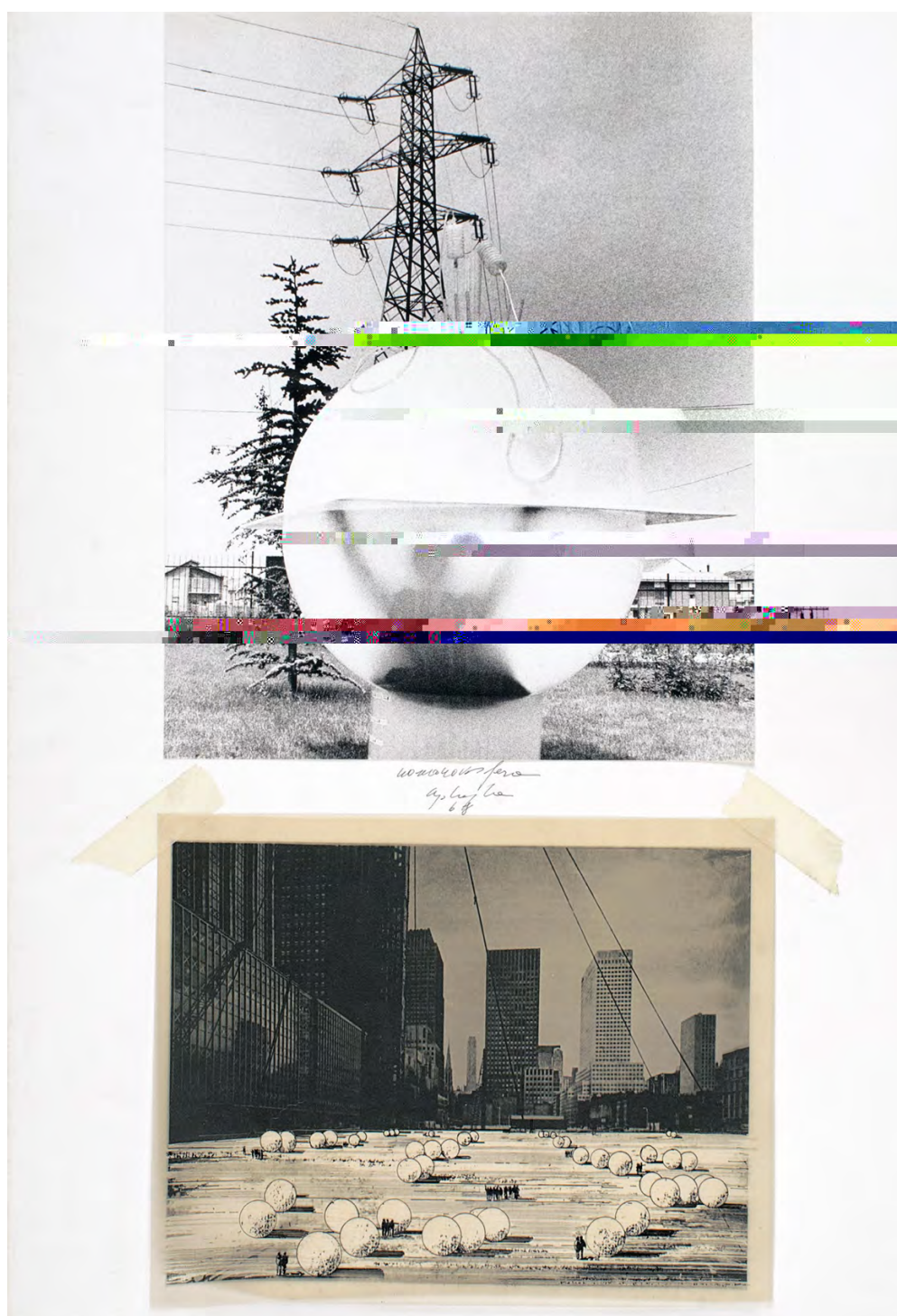
Fig. 5. Immersione-uomouovosfera, 1968. Ugo La Pietra.

not physical, operations. It was only by reclaiming the use of urban space, wrote La Pietra, that it would be possible to chart a new role for humans in the process of transformation. The traces of spontaneous or temporary changes, like the traces of behaviour, the preferential itineraries that grow out of routine, the form generated by experience, non-predetermined creativity and participation therefore constitute the lens through which to view projects that sought to re-establish the role of the community in the city and a new bottom-up design attitude springing from unplanned and mutable approaches (Fig. 5).