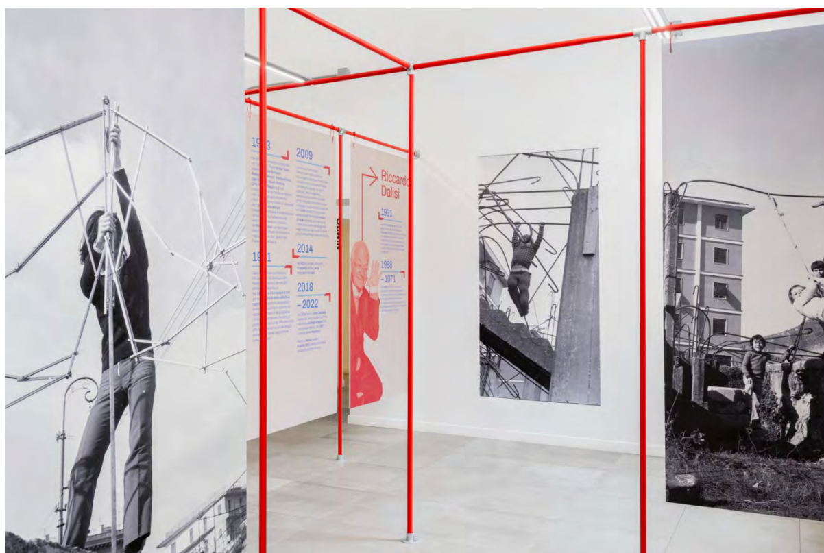
Fig. 6. “Riccardo Dalisi ‘71-‘74. Il Rione Traiano e la partecipazione come progetto [The Rione Traiano and participation as a project]”. Exhibition at Circolo del Design Torino.

The third example looks at the development of methods for participatory practices, through the work of architect Riccardo Dalisi who, from 1968 to 1971, suspended his professional practice and devoted himself to group design experiments, including the experience with the Global Tools collective. His experimentation during this time, significantly influenced by the relationship between design, creativity, and pedagogy, followed a spontaneous methodology, aimed at improving the social conditions of disadvantaged communities.