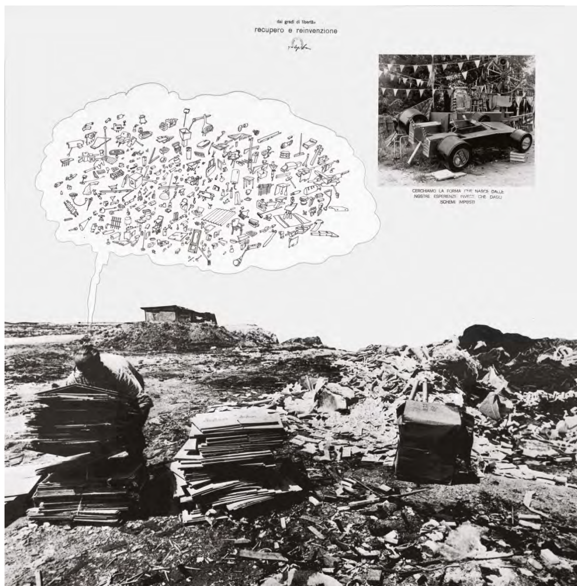
Fig. 4. Recupero e reinvenzione [Recovery and invention]. Ugo La Pietra, courtesy Archivio Ugo La Pietra, Milano.

his earlier research into the “Sistema disequilibrante” “System for undermining balance”, 1960s (Fig. 3), which he later expanded in the late 1970s with the production of experimental films, understood as ‘a means to analyse and decode the environment, record the traces of original creative activity, deconstruct and reconstruct the topoi of urban architecture, develop instructions for behaviour that could give rise to one’s personal city’ 27 (Fig. 4).