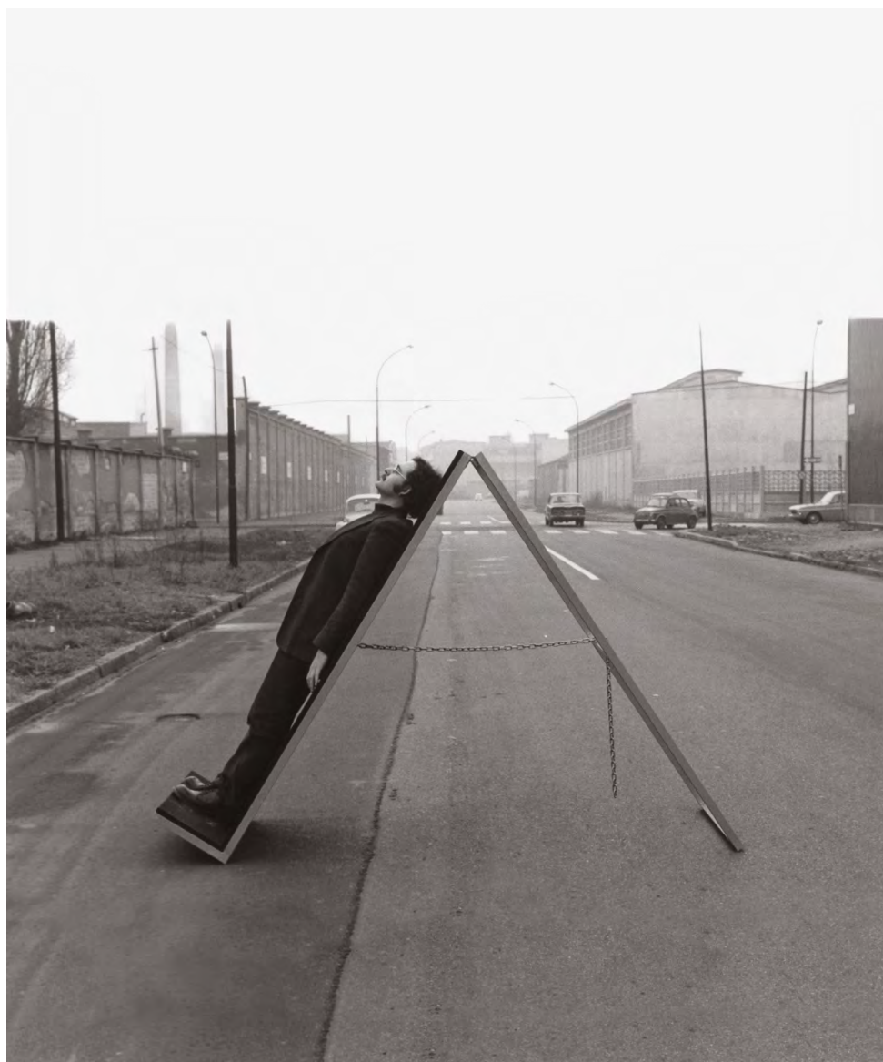
Fig. 3. Il Commutatore, Sistema Disequilibrante – Modello di comprensione [the Commutator, Unbalancing System], 1970, Model of Understanding. Ugo La Pietra, courtesy Archivio Ugo La Pietra, Milano.