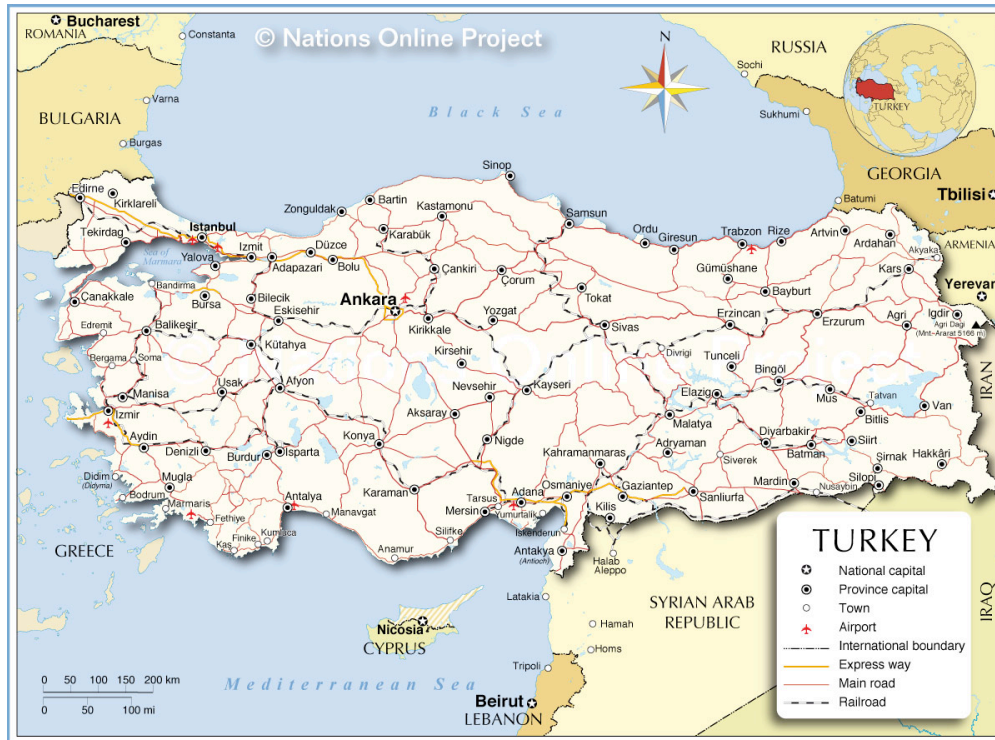
Figure 1: The map of Turkey

those leaving their countries in Asia and Africa and leading to Europe in hope of a better life. The mountainous borders in the east and long coasts with Mediterranean and Aegean Seas in the south and west are hard to control, providing entrance points for the asylum seekers.