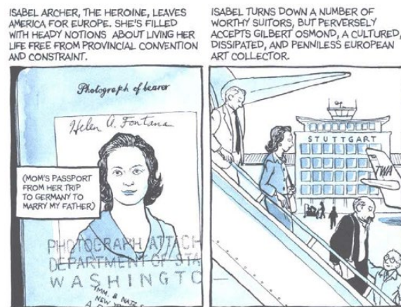
Fig. 2 (Bechdel 71)