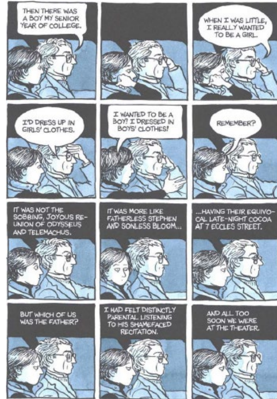
Fig. 8 (Bechdel 221)

The references to Ulysses become more and more present, as if it had been written so that Alison Bechdel could use it in Fun Home . But the intention of this work forces us to focus our attention only on those that help the author of Fun Home to complete her stories. Bechdel's graphic resources are many; on a drawing the last words of Joyce's novel (Bechdel 228):