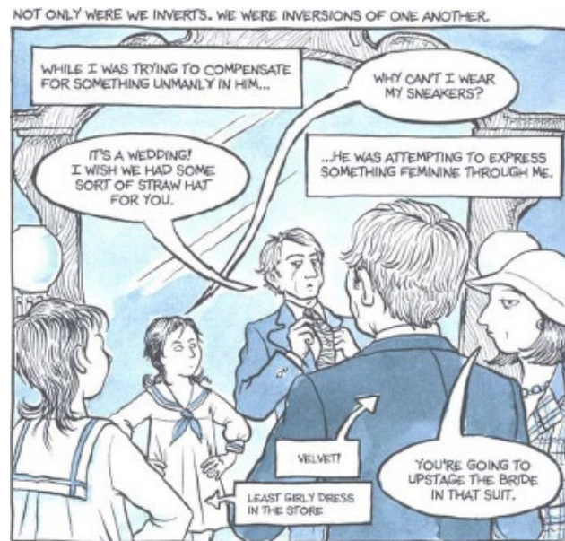
Fig. 3 (Bechdel 98)