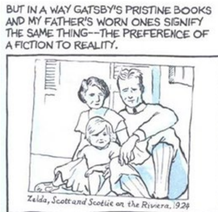
Fig. 1 (Bechdel 85)

Alison has thus created a first sketch of Bruce, a cultured man who prefers to live in a fictional world that allows him to convey to everyone a very high image of himself and of absolute family normality.