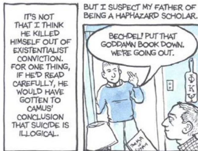
Fig. 4 (Bechdel 47)