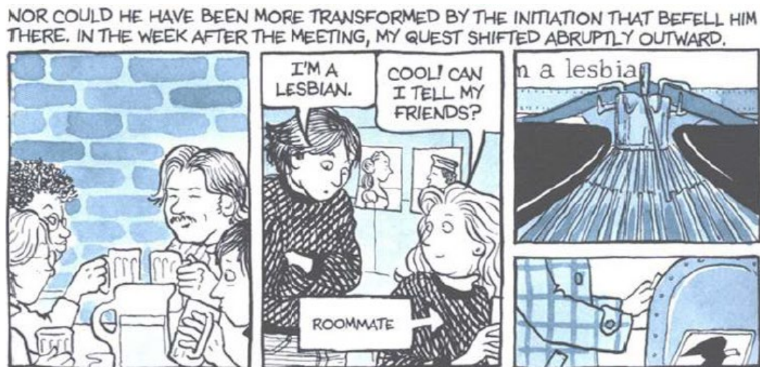
Fig. 6 (Bechdel 210)

thought that he was a queer. Whereas he knew that I knew that he knew that I was too. (Bechdel 212)