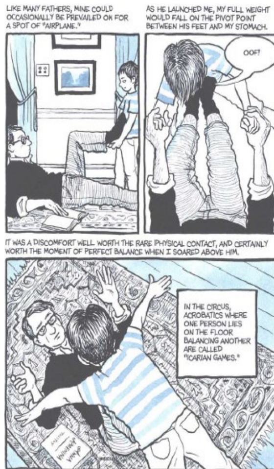
Fig. 5 (Bechdel 3)

comes to light because of his scandals with young girls or his occasional young people or his occasional aggressive and destructive actions.